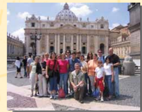
Moody Bible College at St. Peter's