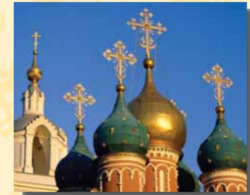
Experience Christianity Throughout the World